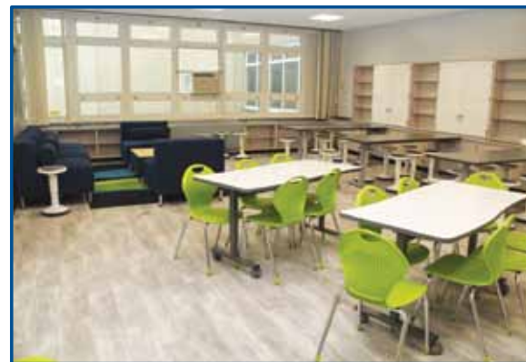
The new makerspace at HMS.