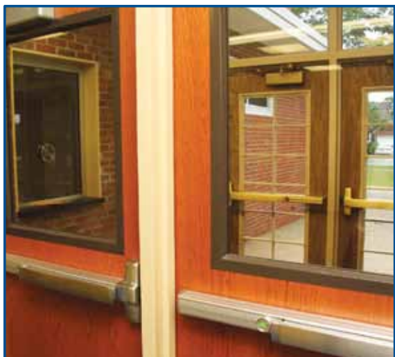
Looking in at the new security vestibule at East Street School.

The district gave the girls locker room a makeover with new paint throughout, flooring, lighting and bathroom fixtures using funds from the annual maintenance budget. Last year, the boys locker room received a similar makeover. New gymnasium bleachers are also being installed at the high school this fall via the 2017-18 capital reserve.