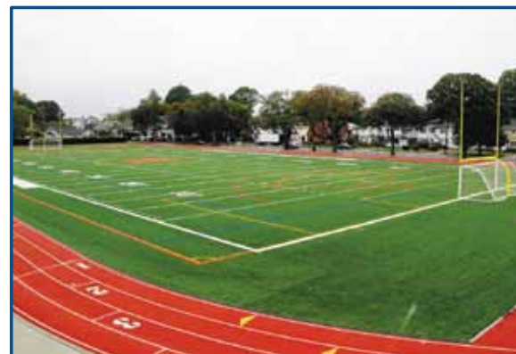
A new turf field and track were installed at HMS.

"Current and future generations of Hicksville students can enjoy a state-of-the-art environment where they can thrive in all aspects of their learning, within a more modern infrastructure that continually emphasizes safety."